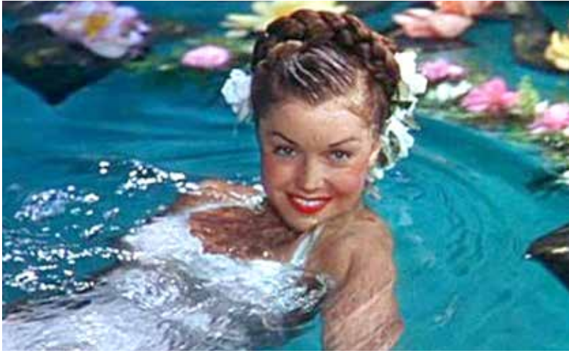
Esther Williams starring in "Million Dollar Mermaid".