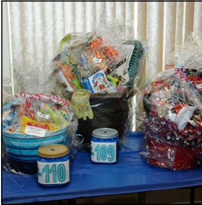
Some of the baskets and gifts at our 2010 event.