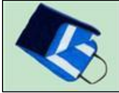
One-Way Slide – used on the chair, helps to keep at risk residents from sliding forward in a chair.