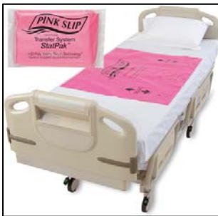
Friction-Reducing Sheet – placed under the resident allows staff to reposition resident in bed with greater ease.

The Safe Patient Handling Law, which went into effect January 1 st of this year, is one of the most comprehensive Healthcare laws recently passed. The Legislature recognizes that nurses, CNA's, and other direct caregivers have the highest number of nonfatal occupational injuries and illnesses involving days away from work than other occupations. Chronic back pain and other job-related musculoskeletal disorders contribute significantly to the decision by nurses and other health care workers to leave their professions, which has exacerbated the shortage of health care providers. Studies show that manual patient handling and movement negatively affect patient safety; quality of care; and patient comfort, dignity and satisfaction. Therefore, this legislation mandates that Healthcare facilities implement "No Lift" and other safe patient handling policies to reduce staff injuries while maintaining safe and comfortable support of residents.